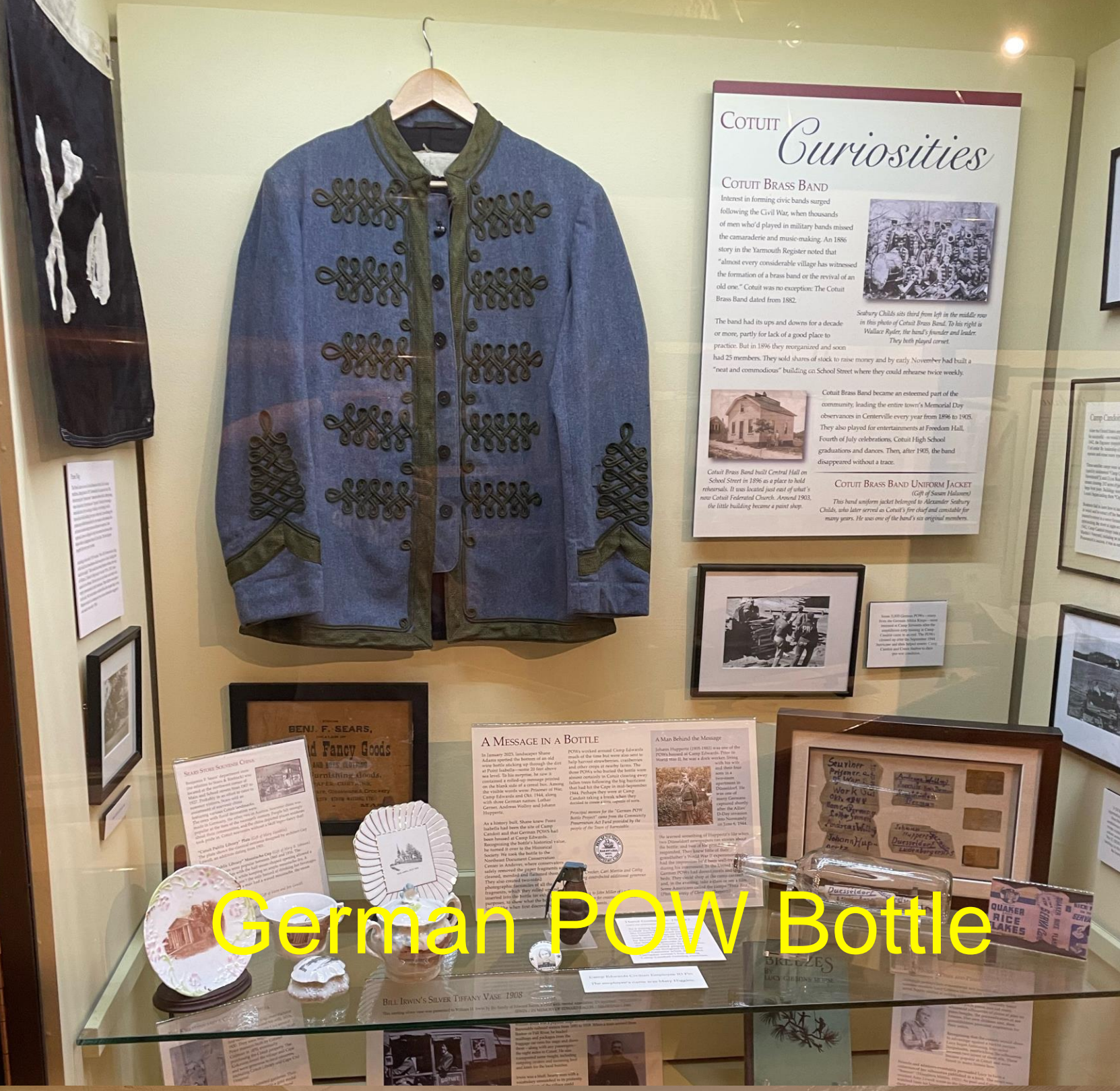
German POW Bottle