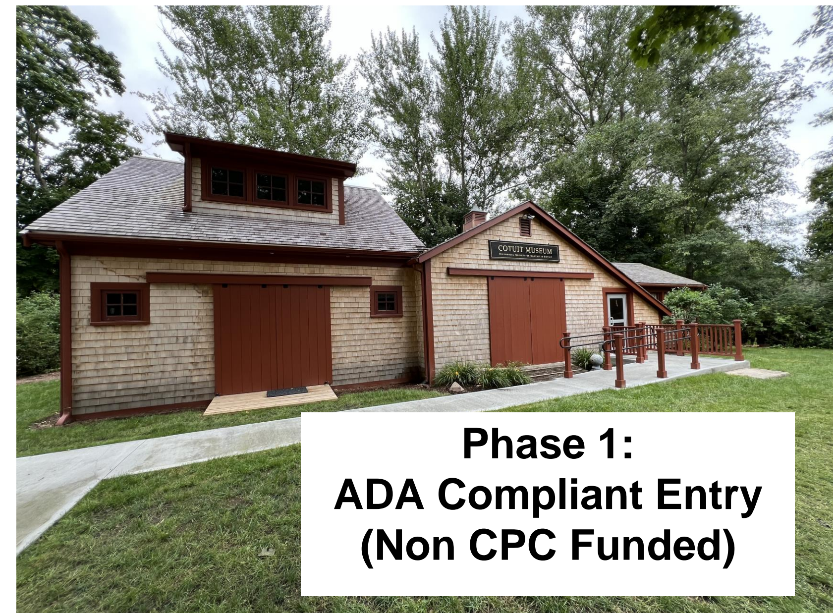
Phase 1: ADA Compliant Entry (Non CPC Funded)