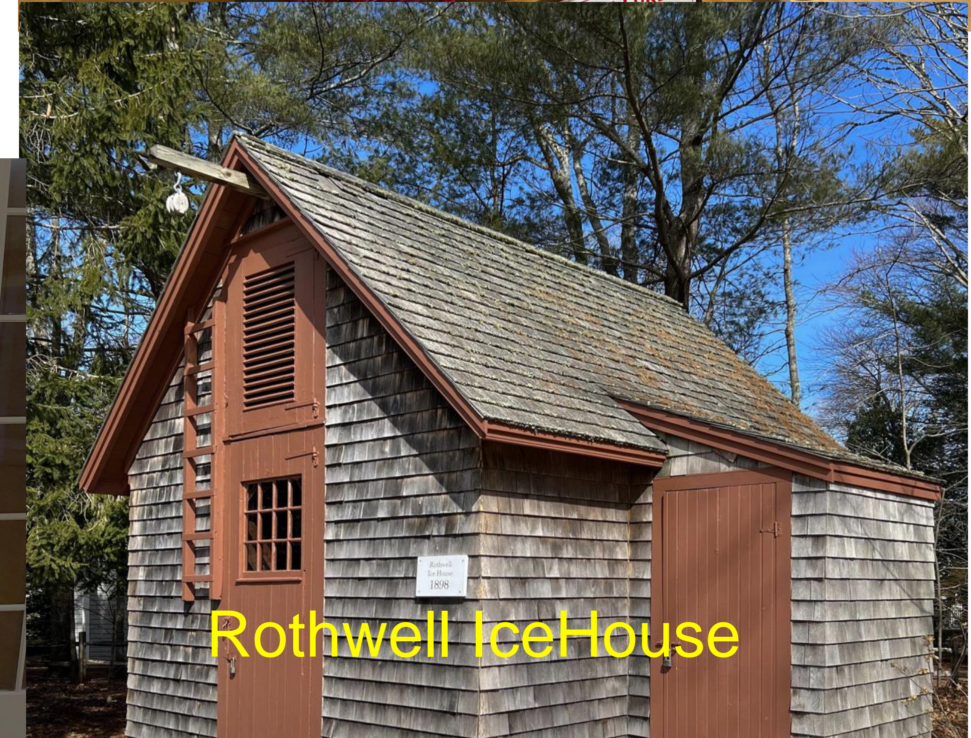
Rothwell Ice House