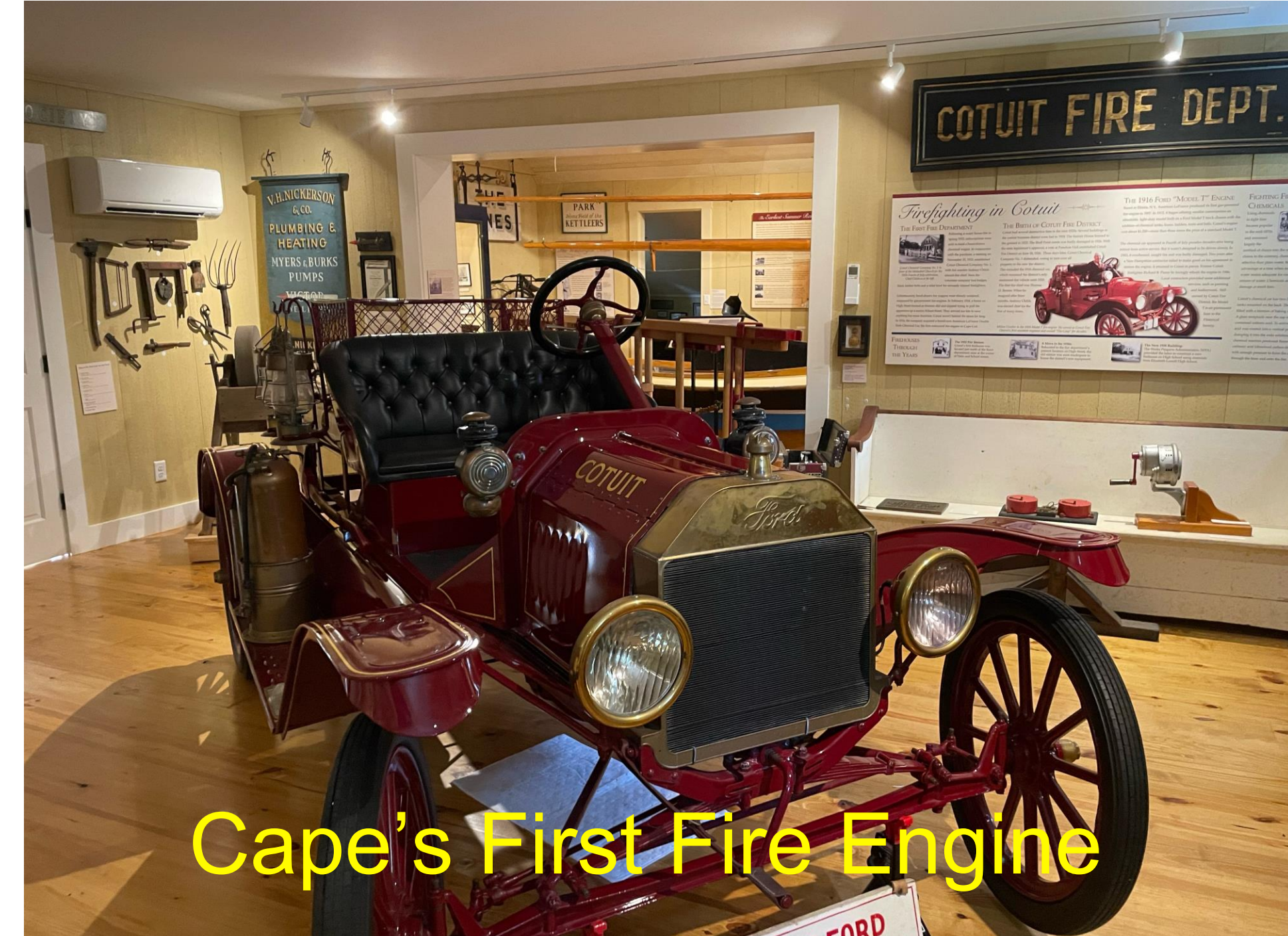
Cape's First Fire Engine