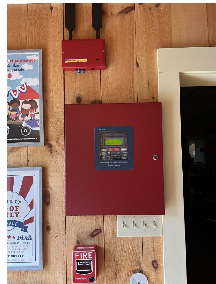
Phase 1: Fire and Security Systems (CPC Funded)